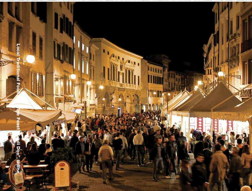
Local Traditional Food The Feast of San Ildefonso, Udine