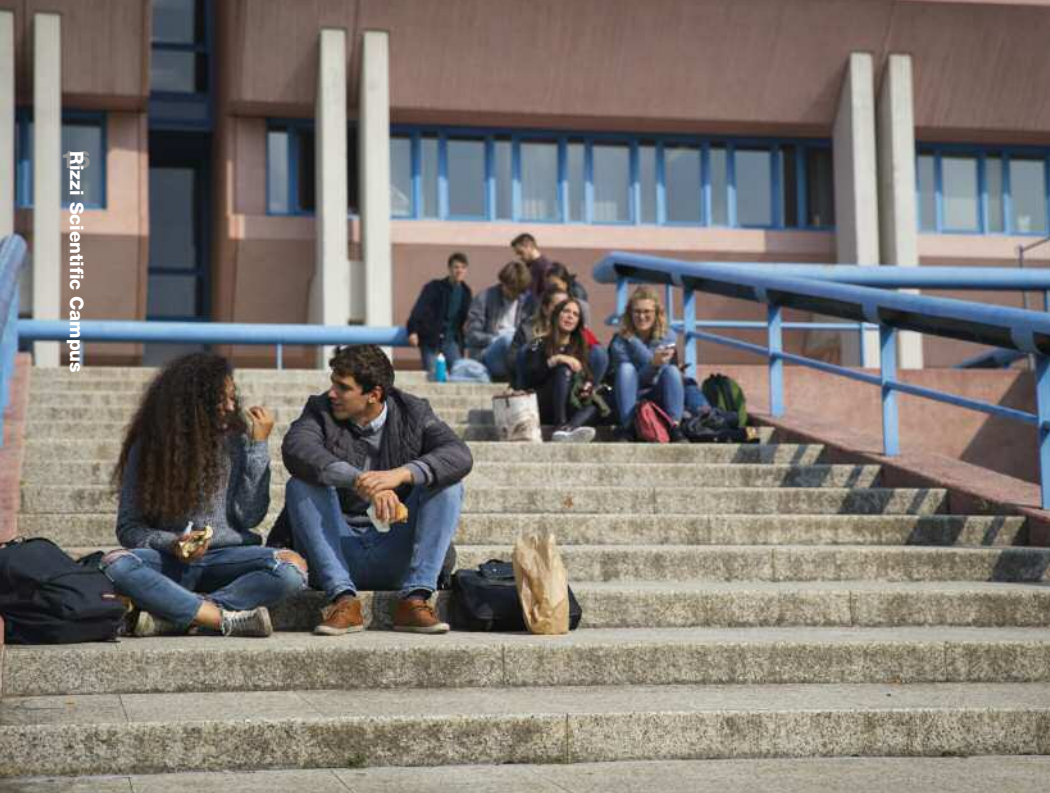
Rizzi Scientific Campus