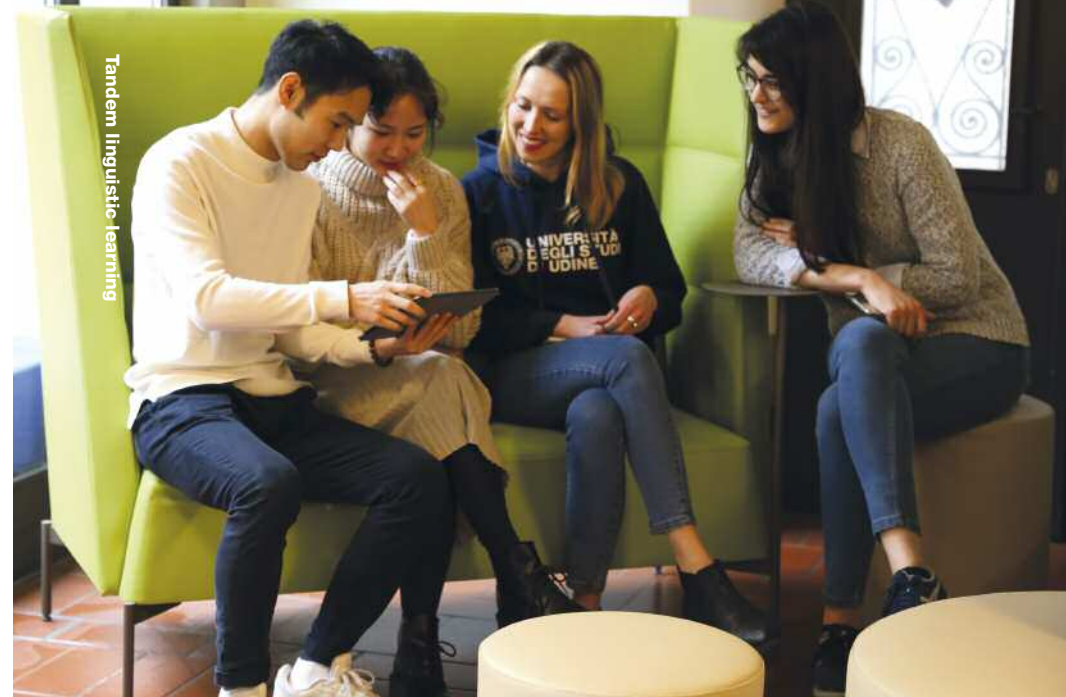
Tandem linguistic learning

The main reason why I decided to study in Udine was because here I could fully focus on my studies, as Udine is a quiet and welcoming city. This experience was extremely pleasant because the University offers accommodation and canteen services, and this means that I did not have to care for them only on my own. Despite the fact that Udine is not a very big city, you can find everything that you might need in your everyday life right here. From Udine it is very easy to go to other fascinating cities like, for example, Venice or Trieste. Also, in Udine there are always entertainment, cultural events, and international activities. Initially, Chinese students may have difficulties in understanding lessons, because of our cultural and linguistic differences. But I found extremely helpful CLAV's language class, where I could learn other foreign languages as well. After studying for 3 years, I have learnt a big deal about Italian language and culture. Now Udine is like a second home to me.