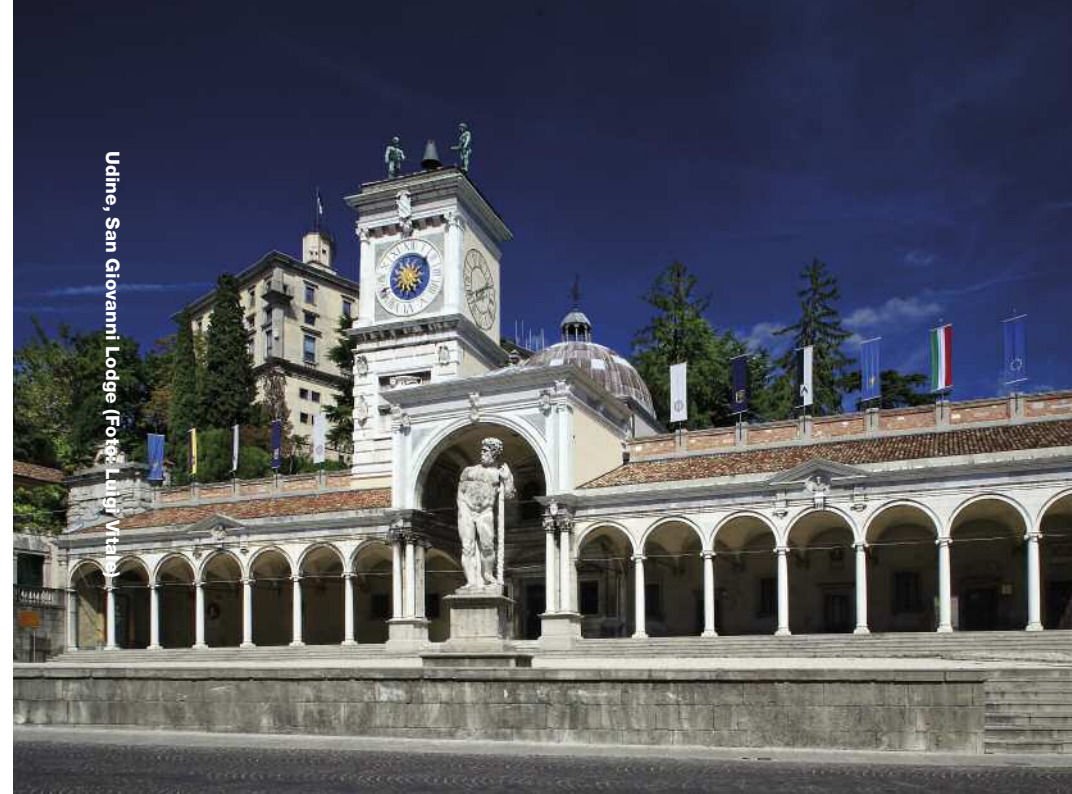
Udine, San Giovanni Lodge

Another legend tells the story of a lake monster, who threatened people and eventually would eat them. One day a saint, who was a skilled warrior, walked by and killed the monster. It is said that what the archive of the Madonna delle Grazie monastery guards, is one rib of that dangerous beast.