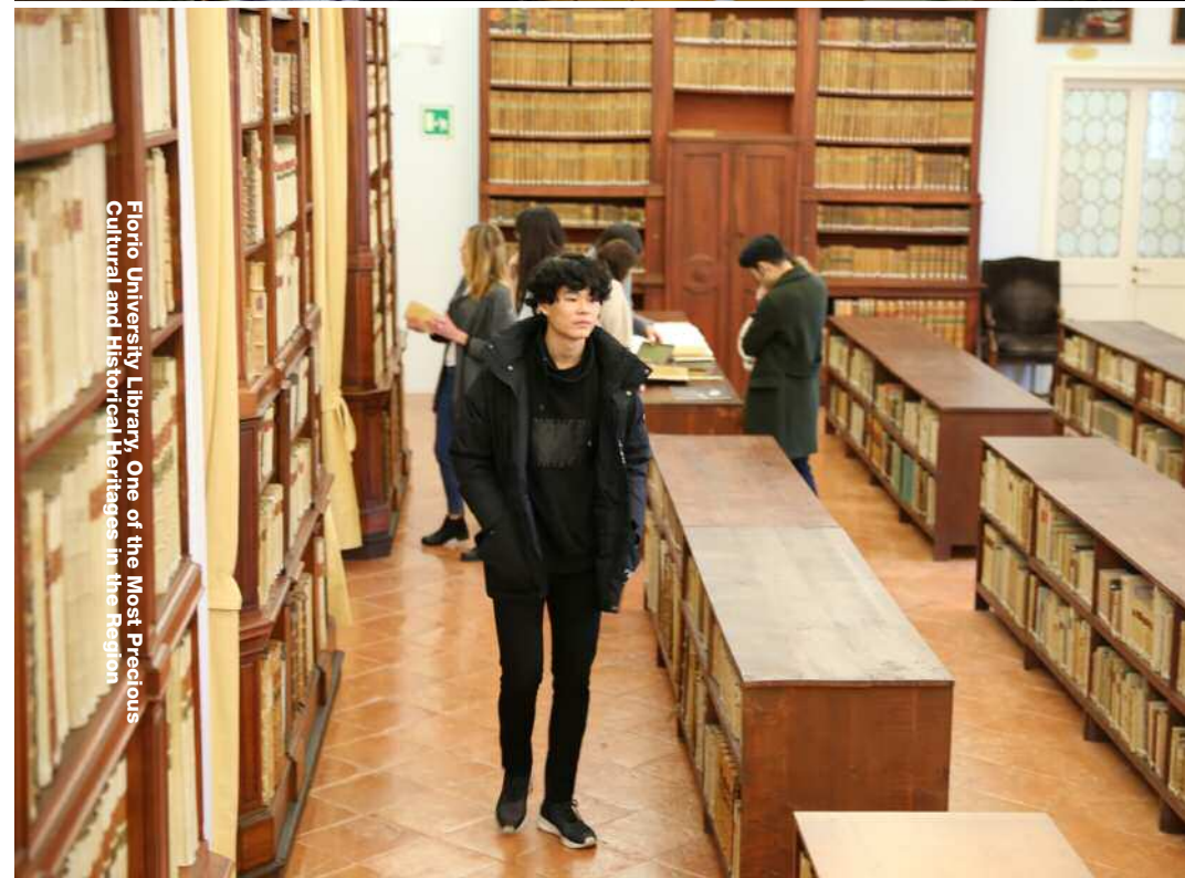
Florio University Library, One of the Most Precious Cultural and Historical Heritages in the Region