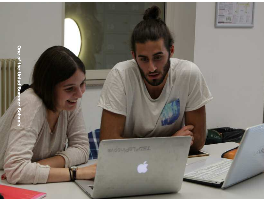
One of the Uniid Summer Schools