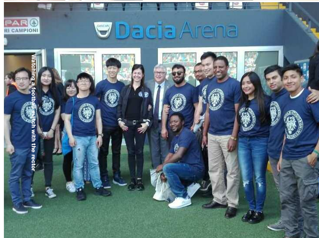
Watching a football match with the rector