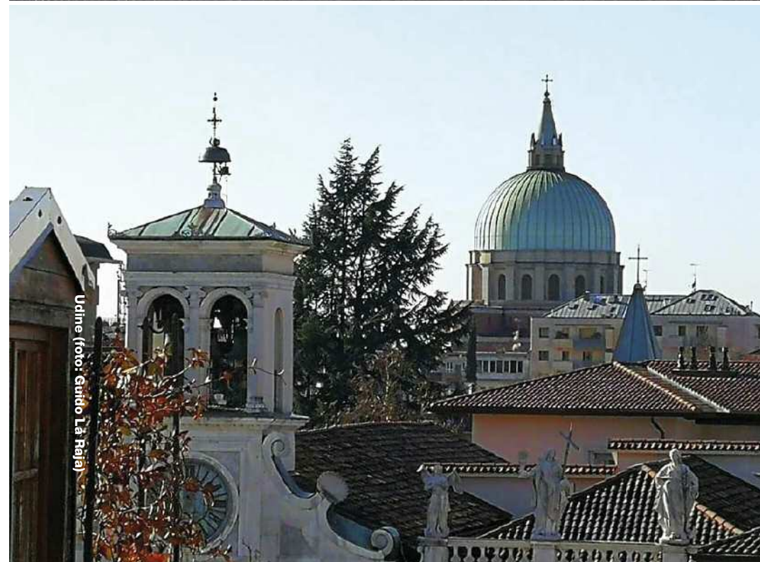
Udine