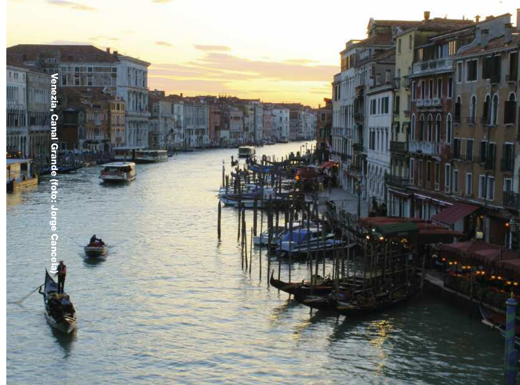
Venezia, Canal Grande

Venice is world known for its beauty and charm. The city is basically an open-air museum, wherever you go you are surrounded by arts and building which are typical of the Venetian style. If you want to see the real Venice you need to lose yourself between the so called “Calle”, the name given to the Venetian streets, and experience the beauty of this one-of-a-kind-city. Venice is not famous only for its beauty but also for what it has to offer to tourists such as museum, festivals and events.