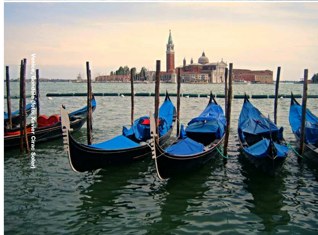
Venice, gondole