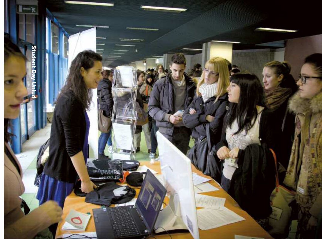
Student Day Univid