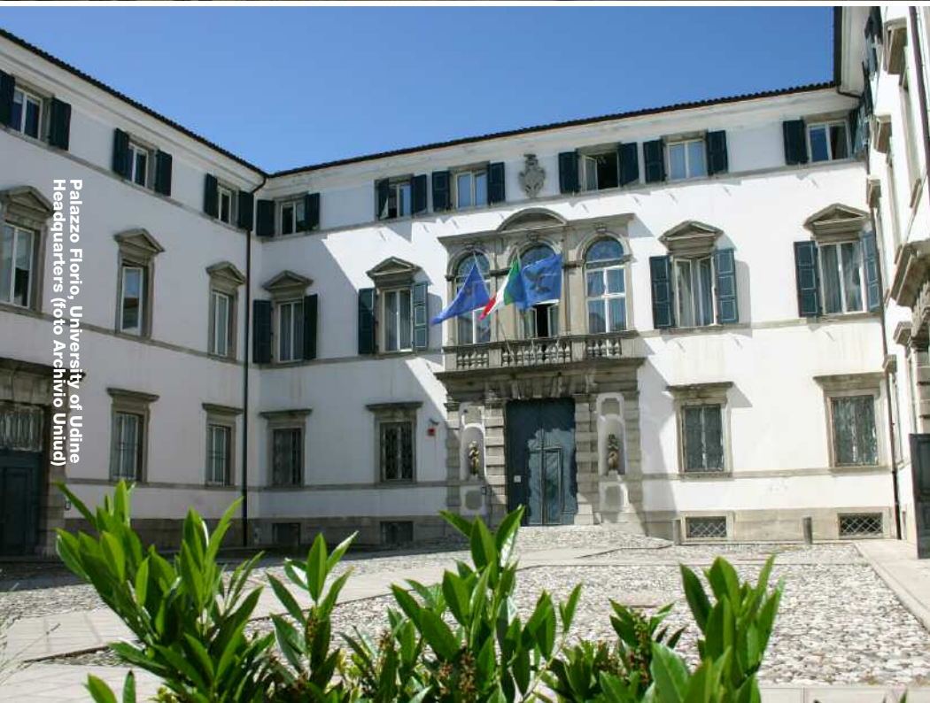
Palazzo Florio, University of Udine Headquarters