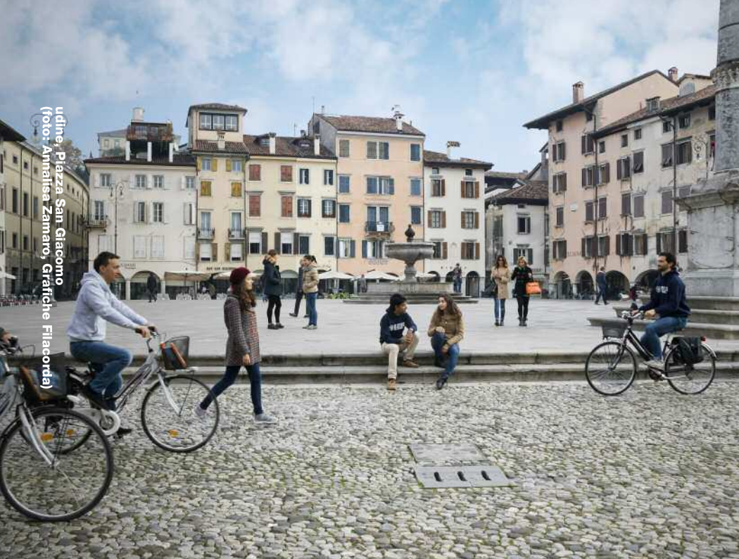
Udine, Piazza San Giacomo